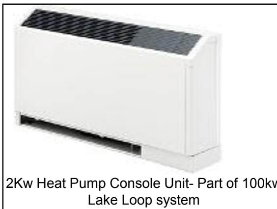
2Kw Heat Pump Console Unit- Part of 100kw Lake Loop system