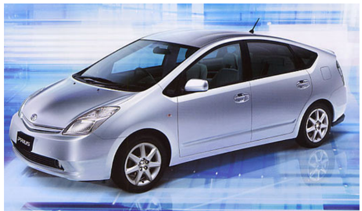
Toyota Prius - One of the most fuel efficient cars on the market today.

Clean drive is 75% funded through the European Commission's Intelligent Energy for Europe programme.