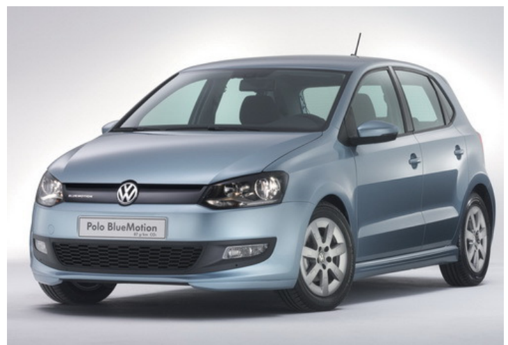
2010 VW Polo Diesel BlueMotion — 83.1mpg!

10 Local Action Groups, one for each country (but two in Germany) are to study the car market in their country and identify how to convince car dealerships to get on board with the project.