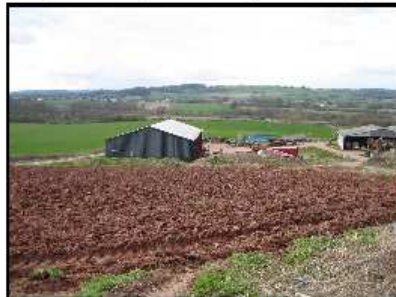
The site of the proposed digester at Great Porthamel Farm

The Biogas Regions project has been lending support to the Jones family in their efforts to secure planning permission for an Anaerobic Digestion plant at their farm close to Talgarth on the edge of (but within) the Brecon Beacons National Park. The application was first submitted in November 2007, coinciding almost exactly with the kicking-off of the Biogas Re-