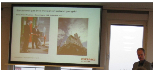
Gas grid operator, Dong (73% owned by Danish Gov.) is also building off-shore windfarms in Denmark and the UK.

We were assured that all of the necessary technology already exists and that the market is very nearly ready for